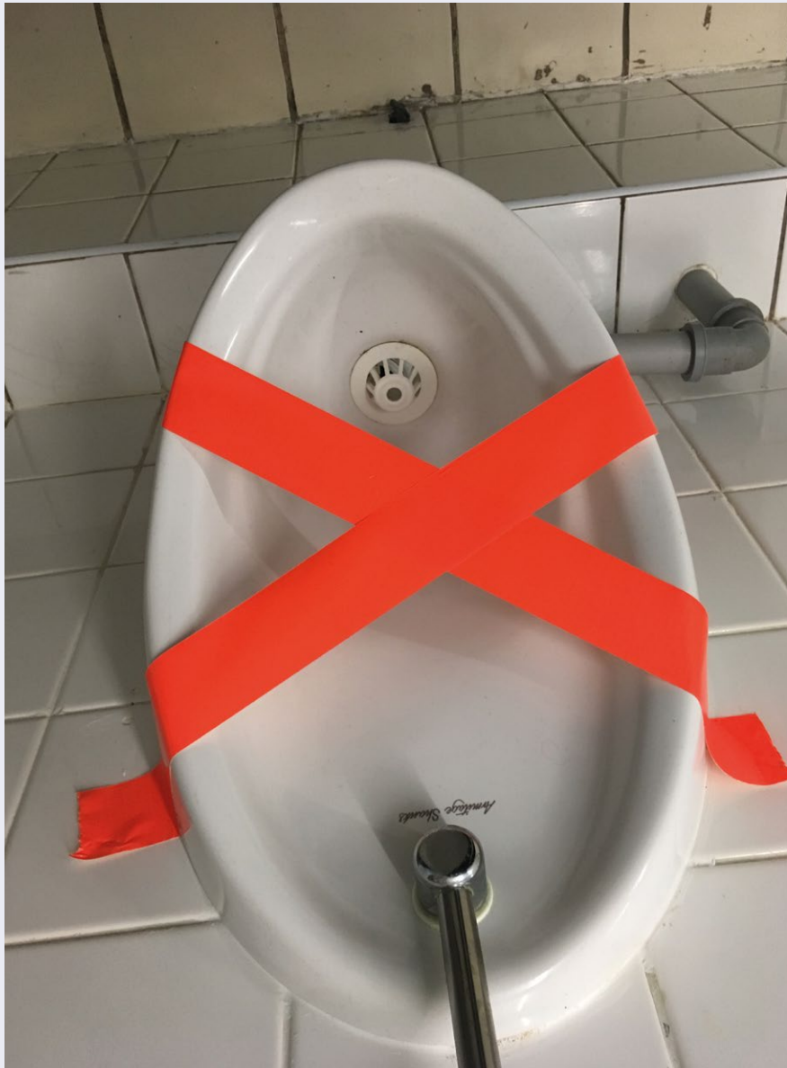
Figure 3 Steve Pool. Fountain not in use.